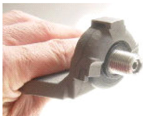
The SMP is slightly visible attached to its cleat.