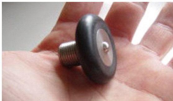
The SMP is 1½" in diameter and made from titanium and aluminum alloys.